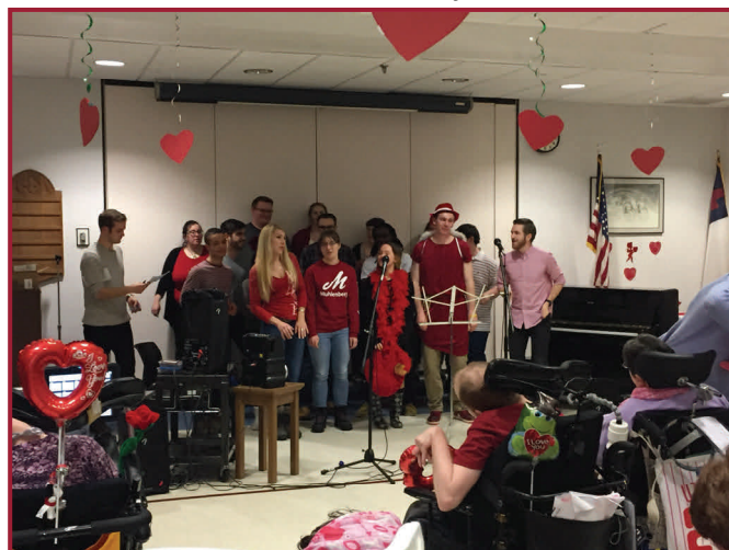
Residential Services staff perform for residents at Good Shepherd